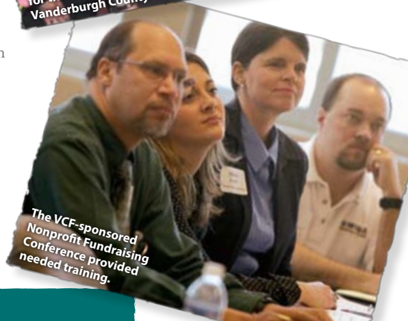
The VCF-sponsored Nonprofit Fundraising Conference provided needed training.