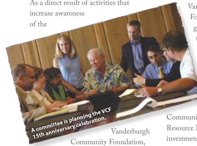
A committee is planning the VCF 15th anniversary celebration.

Vanderburgh Community Foundation is actively engaged in carrying out a three-year Sustainable Resource Development plan to broaden community involvement. As a direct result of activities that increase awareness of the