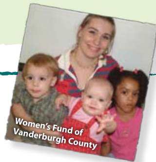
Women's Fund of Vanderburgh County