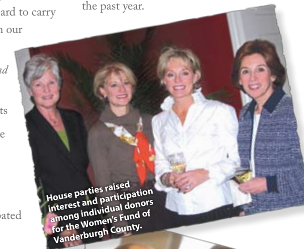
House parties raised interest and participation among individual donors for the Women's Fund of Vanderburgh County.