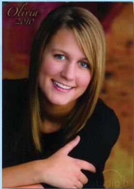
Olivia O'Dell Memorial High School Indiana University