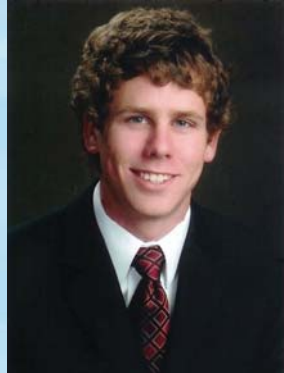
William Sievern Memorial High School University of Notre Dame